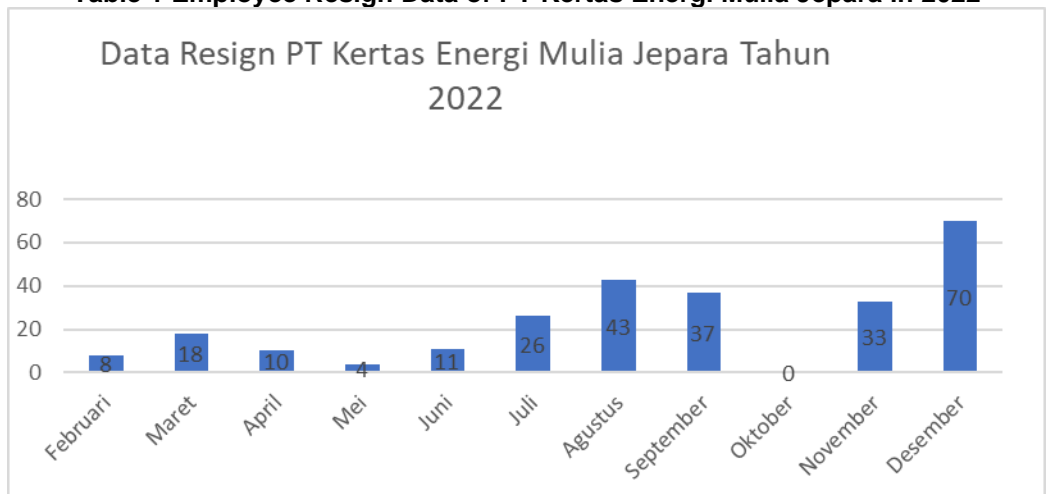
Table 1 Employee Resign Data of PT Kertas Energi Mulia Jepara in 2022

Manufacturing companies like PT Kertas Energi Mulia Jepara often experience turnover. In the last two months, this has been the case. PT Energi Mulia Paper states its mission as follows. relationship with data: